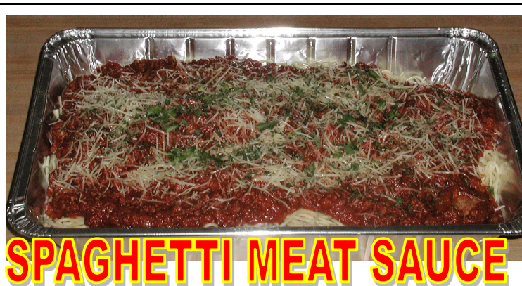
SPAGHETTI MEAT SAUCE

Any Other Pasta From Our Restaurant Menu That You See Can Be a Tray of Pasta