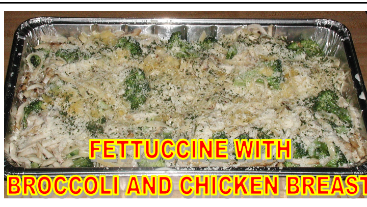
FETTUCCINE WITH BROCCOLI AND CHICKEN BREAST