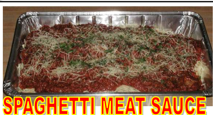
SPAGHETTI MEAT SAUCE

Any Other Pasta From Our Restaurant Menu That You See Can Be a Tray of Pasta