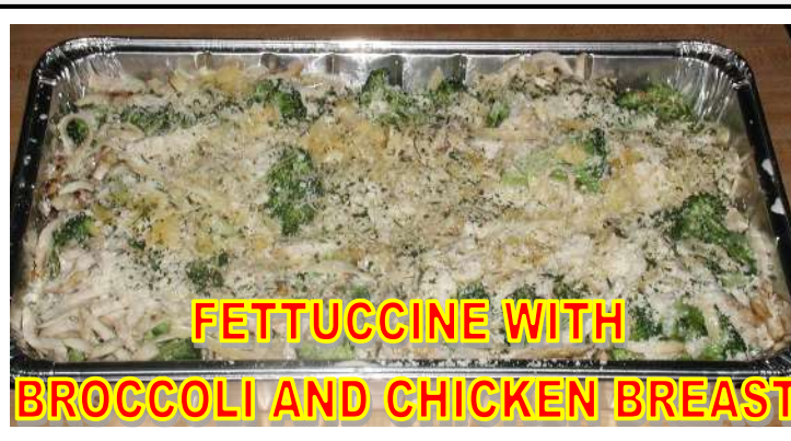
FETTUCCINE WITH BROCCOLI AND CHICKEN BREAST